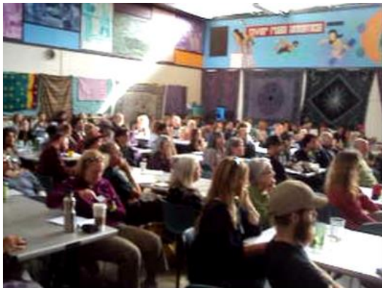
Green and Resilient Neighborhoods Presentation

In honor of 2016 Vegan Awareness Year ---EVEN is thrilled to collaborate with Tamera and PCRM!