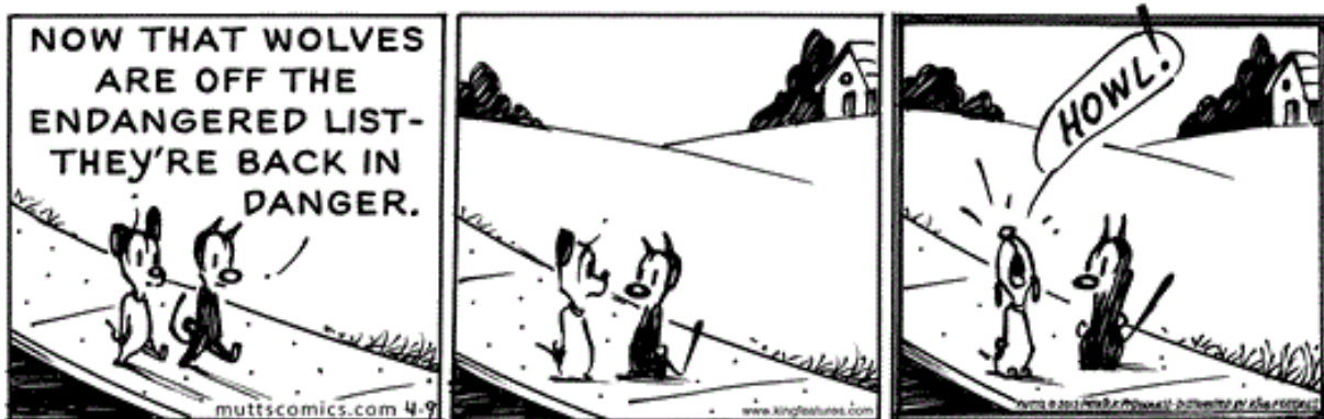
(Patrick McDonnell is an animal-sensitive, veg cartoonist who knows the danger all too well.)