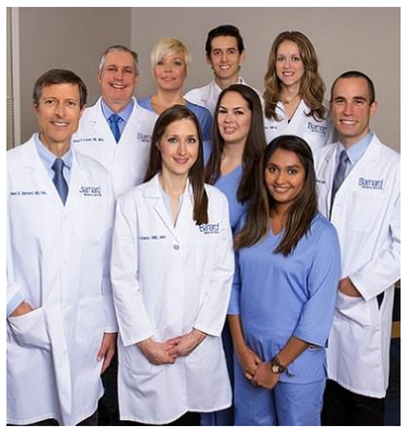
Barnard Medical Center - 2016 A New Model for Medical Care

In 2016, he founded the Barnard Medical Center in Washington, DC, as a model for making nutrition a routine part of all medical care.