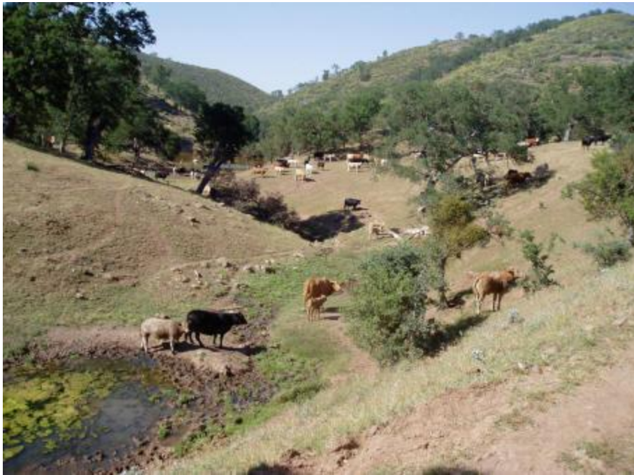
Land stripped from over-grazing cattle.

countries already struggling with hunger, poverty, loss of productive topsoil, and human sickness will be particularly hard hit. Importantly, although natural sources of greenhouse gas (GHG) emissions do exist, humans are to blame for the degree of climate change we are currently experiencing, because it is largely a byproduct of our actions—certain habits that have resulted in excessive GHGs being increasingly emitted into our atmosphere over the past century. Unfortunately, previous conferences of this type have ended in lack of formal agreement and have missed targets for change. The two largest emitters in the world, China and the U.S., don't even participate.