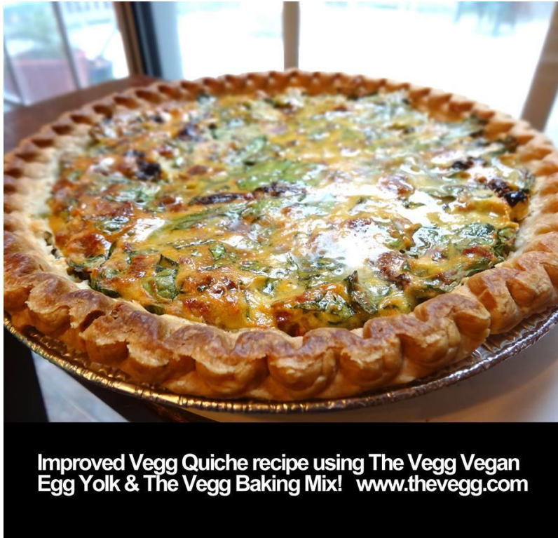
Improved Vegg Quiche recipe using The Vegg Vegan Egg Yolk & The Vegg Baking Mix! www.thevegg.com